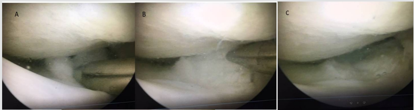
Figure 2- A: The cell seeded hyaluronic acid graft is pushed into the cartilage fibrin filled lesion with an arthroscopic probe. B: The cell seeded graft has now been positioned in the lesion and is smoothed with a curved tonsil elevator. C: The cell seeded graft's stability has been tested by flexion-extension motions of the joint and no tendency for dislocation.

layer and the seeded membrane can then finally be introduced into the defect. The seeded porous layer, is placed on the bone bottom surface filled with fibrin glue like what is done with ACI type 2. Finally, the top of the membrane is fixated with fibrin glue even though some doctors add sutures if the procedure has been done as open surgery.